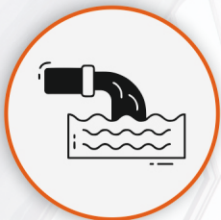
Water & Waste Water Treatment