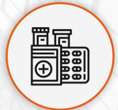
Chemical & Pharmaceuticals